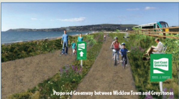
Proposed Greenway between Wicklow Town and Greystones