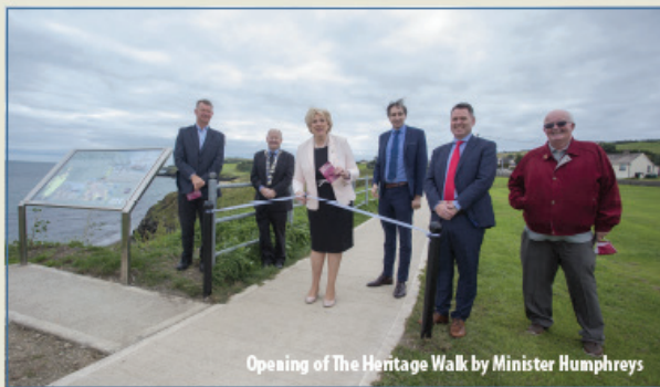
Opening of The Heritage Walk by Minister Humphreys