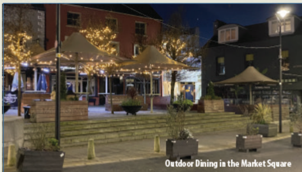
Outdoor Dining in the Market Square